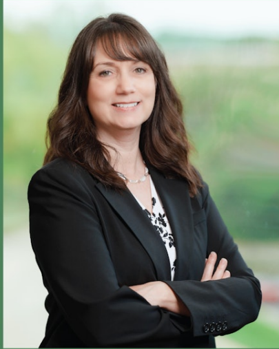
AMIE Settlement Paralegal 3 Years